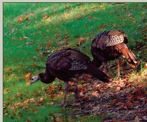
A flock of turkeys visited our back yard. As they ambled and pecked they found something good to eat among the leaves. Once, a 'Peeping Tom' hen sat on an Infirmary widow sill to catch a glimpse of a sister.