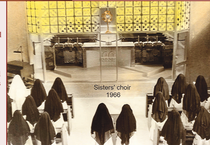
Sisters' choir 1966

Once again, as in our original Monastery in Detroit, we have choir stalls that face inward on either side of the center aisle so that the two choirs can chant alternate strophes of psalms and canticles. And true to our charism as Nuns of the Order of Preachers, by proclaiming of the Good News to one another in the Divine Office, we become a ‘holy preaching.’