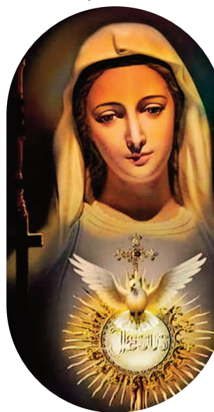
St. Louis de Montfort, The Secret of the Rosary Cf. 44-45.

Our Blessed Mother explained to St. Mechtilde that each “Hail Mary full of grace”, echoes the Archangel’s salutation to her on the day of the Annunciation when she was made Mother of the Son of God. Our Mother continued, “no prayer you could possibly compose would give me the joy and delight of the Hail Mary. When people say, ‘The Lord is with thee’, they renew the indescribable joy that was mine when the Eternal Word became incarnate in my womb.