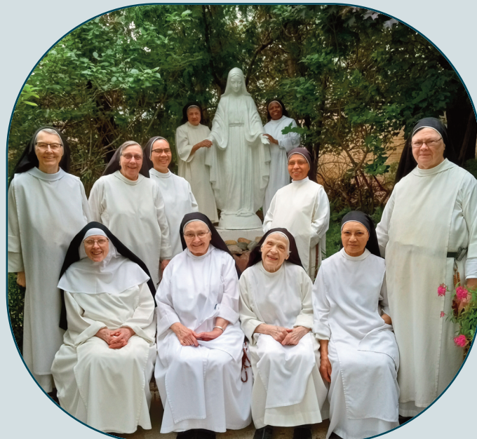
Some of our sisters took a rare 'field trip' outside of the enclosure to welcome our Mother home. Each one took a moment to ask her for one of her special blessings.