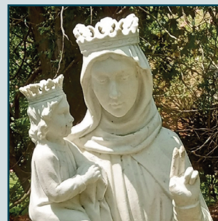
Our Lady with Jesus from the Mt. Thabor Monastery 'listened' to your prayers while Our Lady of Grace, from our Shrine, was getting a new look, see page 6 . Our Lady the Queen is still listening from within the Cloister, outside our Infirmary. You can see her from the road as she keeps guard over the intersection of Middlebelt and 13 Mile Roads.