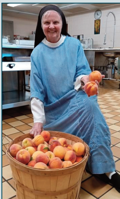
We have two dwarf peach trees, the harvest of the first tree filled a bushel basket. Not bad for a 'little' tree, considering that our apricot tree, five times its size, produced only 14 apricots.